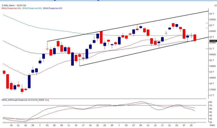
Exhibit 2: Nifty Bank Daily Chart

The Bank Nifty too corrected on the expiry day and posted a loss of a couple of percentage. The index has been trading in a channel and it has ended at the lower end of the channel which is placed around 21600 . Today's move would be crucial in the index as if it gives a weekly closing below this support, then it could lead to some further correction in the near term upto 21000-21100 . On the flipside, the index needs to break above 22350 for a probability of any pullback move. Traders are advised to stay light on positions and watch for the above mentioned developments.