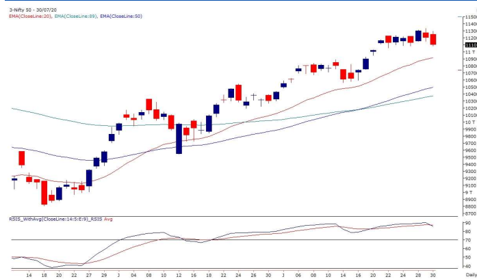
Exhibit 1: Nifty Daily Chart

On the sectoral front, throughout the day, the entire 'Pharma' space kept buzzing and it was bucking the trend along with the Cement counters.